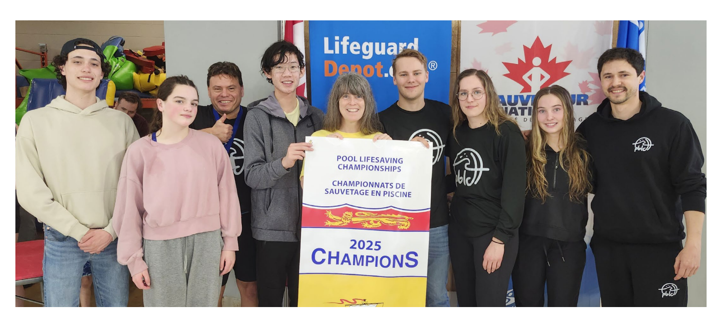
2025 Pool Lifesaving Championships winner, Dieppe Aquatic and Sports Centre

Happy Easter! The Lifesaving Society's office will close Friday, April 18 and Monday, April 21 for Easter weekend. We reopen Tuesday, April 22 at 9:00 a.m.